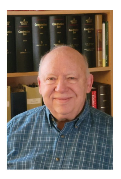
The Heuer Law Group